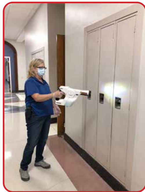
Custodial Staff Member