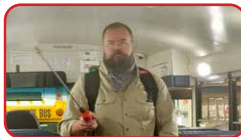
Transportation Staff Member